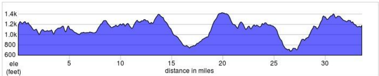
Medium Tour 33 Miles (Mile Markers: https://ridewithgps.com/routes/21114192 )