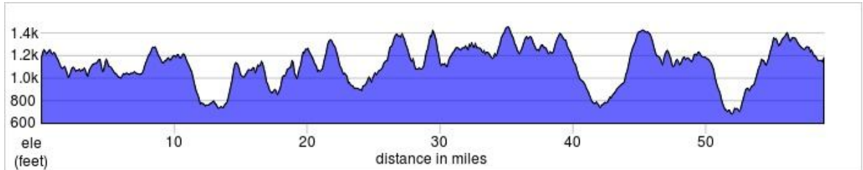
Long Tour 59 Miles (Mile Markers: https://ridewithgps.com/routes/21113894 )