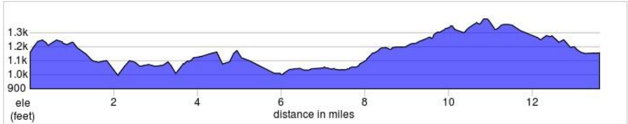
Short Tour 13 Miles (Mile Markers: https://ridewithgps.com/routes/21122145 )